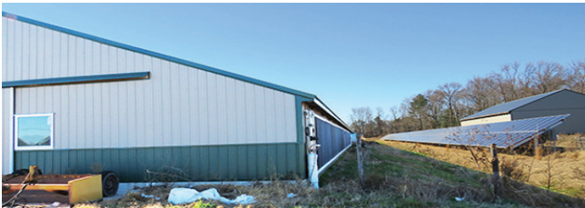
Kauffman Traditions, Organic Poultry - Houston