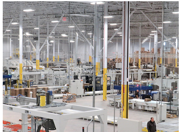
LED lighting installed throughout