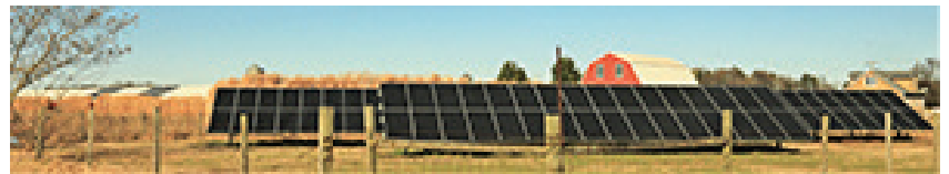
Gryffens Roost Poultry - Houston