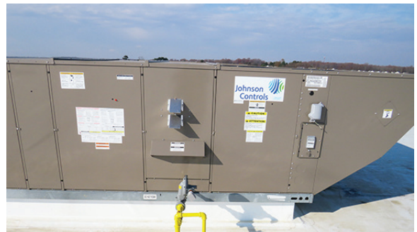
Energy- efficient HVAC unit. Numerous on the roof

Skotta Poultry Farm in Georgetown - The Skotta family have 10 poultry houses, 7 in Georgetown and 3 in Greenwood. Their 160 solar panels provide energy for two farms and their households.