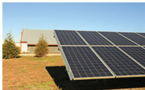
Poultry house with solar panels