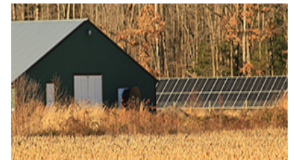
Kauffman Farms Harrington