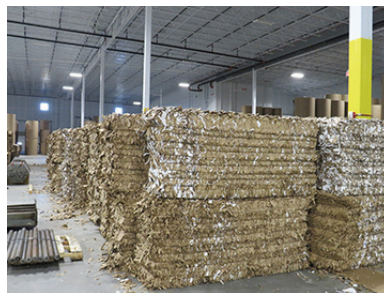
Recycled waste chopped & baled and shipped back to paper manufacturer