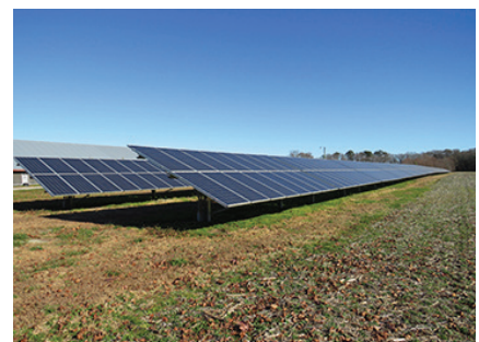
Two rows of 80 solar panels running the length of his field