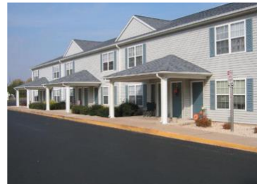
Savanah East and East Atlantic - Milford Housing Development Corporation properties