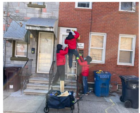
Photos of Lights On team installing lights in Browntown in Wilmington

Installation of energy efficient lights is continuing statewide. The Lights On team is working with civic organizations and property management organizations. Due to COVID-19, the door-to-door canvassing is still not underway. The program has completed over 400 installations in 2021. We are working to get the energy savings data entered in Energy Orbit for this program. HELP Initiative staff is working to expand this program into other communities.