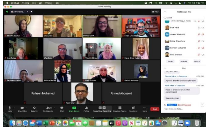
Photo of Statewide Islamic community with Green Muslim Presentation

Climate Conversations – Coordination continues with various organizations interested in hosting Climate Conversations. Krishna Village Community presentation was postponed and two others are scheduled in March for Master Naturalists through the DE Cooperative Extension Service and the Delaware Intercampus Climate Coalition (DEICC) for several events hosted by Del Tech. https://www.deicc.org Future events are in planning stages for the Lutheran Church of Our Savior, NAACP & Southern Delaware Alliance for Racial Justice, St. Peter’s Episcopal and other faith communities. For additional information contact locke@delawareipl.org