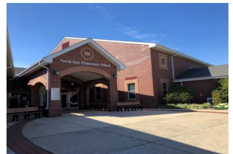
Photo- North Star Elementary Hockessin, Delaware

– Mini Grants were awarded to nine Delaware K-12 schools this year to include five public schools and four private schools across the State. Energy assessments were completed at North Star Elementary School in Hockessin and at Urban Promise School in Wilmington. Due to the COVID, energy audits are conducted in person and then followed by a virtual meeting to walk students through findings. This allows more students to participate in a virtual setting. Data from the energy audits and follow-up implementation reports is being uploaded into the Energy Orbit Energy Savings Database. Building operator training will be offered as online webinars in April - June 2021. Resources: - Pathways Resources document