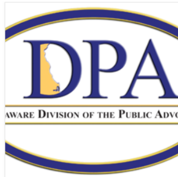
Division of the Public Advocate (DPA) - State of Delaware

You can learn more about the important role the Division of the Public Advocate plays by visiting https://publicadvocate.delaware.gov/